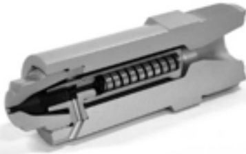
Type A(S) Spring Loaded

Molders Services, Inc. (MSI) is proud to represent Herzog-AG Degersheim, developers and manufacturers of the world's finest nozzles for the plastics industry. With precision-crafted nozzles for nearly every application, MSI, together with Herzog offer the quality and performance demanded by today's plastic injection equipment and trusted molding companies. Call us today for a budgetary quote including nozzle selection, delivery and implementation.