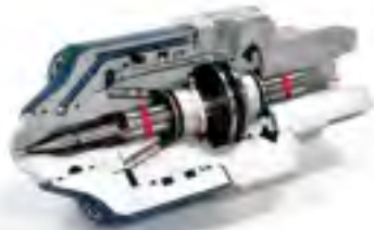
Type NE - Elastomers