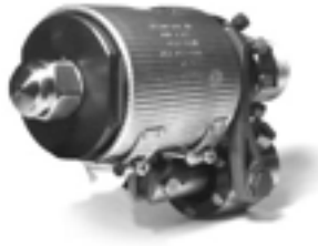
Type BHP-full rotary bolt