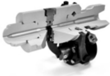
Type BHP Bolt Shutoff