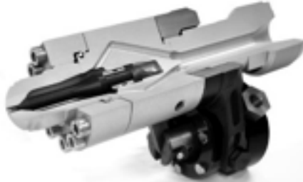
Type HP Needle Shutoff